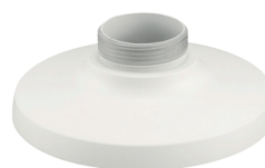
SBP-167HMW (White) / SBP-167HM (Ivory)