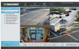
Local Management, Viewing Interface & Remote Viewing with Web Browsers