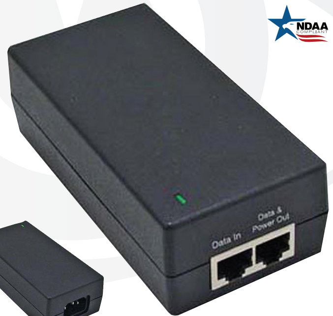
*Rear (Power Cable Port)