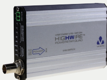
HIGHWIRE POWERSTAR QUAD is also available with 4-port POE switch