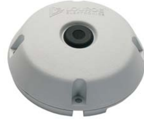
MODEL A USB MICROPHONE

The Model® Verifact A USB is an omni-directional, low impedance, electret condenser microphone with a USB audio output. It can pick up normal sounds approximately 15 ft. away, or within a 30 ft. diameter circle. It is primarily designed for ceiling mounting but can also be installed on any type of flat surface. The Verifact A USB is compatible with a device that accepts USB audio input.