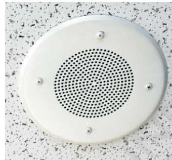
Model TLI-CF Ceiling Mount - Flush

Federal Law References: Federal Regulations, US Code, Title 18. Crime and Criminal Procedure, Sec 2510.