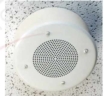
Model TLI-CS Ceiling Mount - Surface