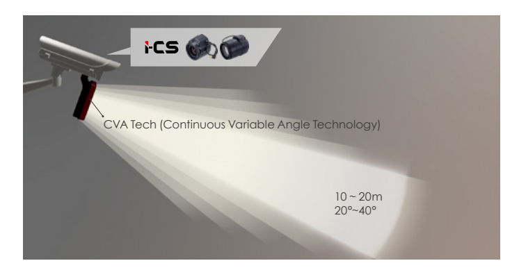
Remote Zoom and Beam Angle Settings for Easy Installation

Equipped with the i-CS (intelligent-CS mount) lens and remote controllable IR illuminator, the camera enables installers to remotely adjust zoom/focus and beam angle of IR for easy setup and fine-tuning setting.