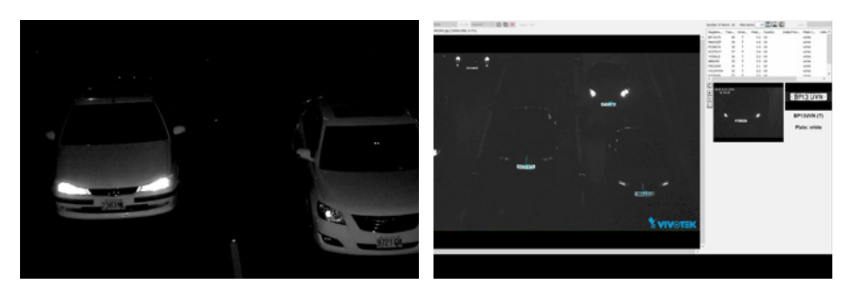
Clear Image Captured with IR Illuminators and Headlight Filter

Capturing images at night is a challenging issue for any surveillance application, but for License Plate Capture applications the challenge is even greater due to noise and glare caused by the headlights of cars. The IP9165-LPC-v2 Kit is equipped with external 48W/80W IR Illuminators and a delicate headlight filter, which help to filter out reflected light and only capture detailed information from the plates. Moreover, the IR threshold is also programmed to deploy the IR Illuminator automatically to ensure 24/7 & Day/Night performance.