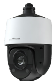
Included Wall Mount Bracket