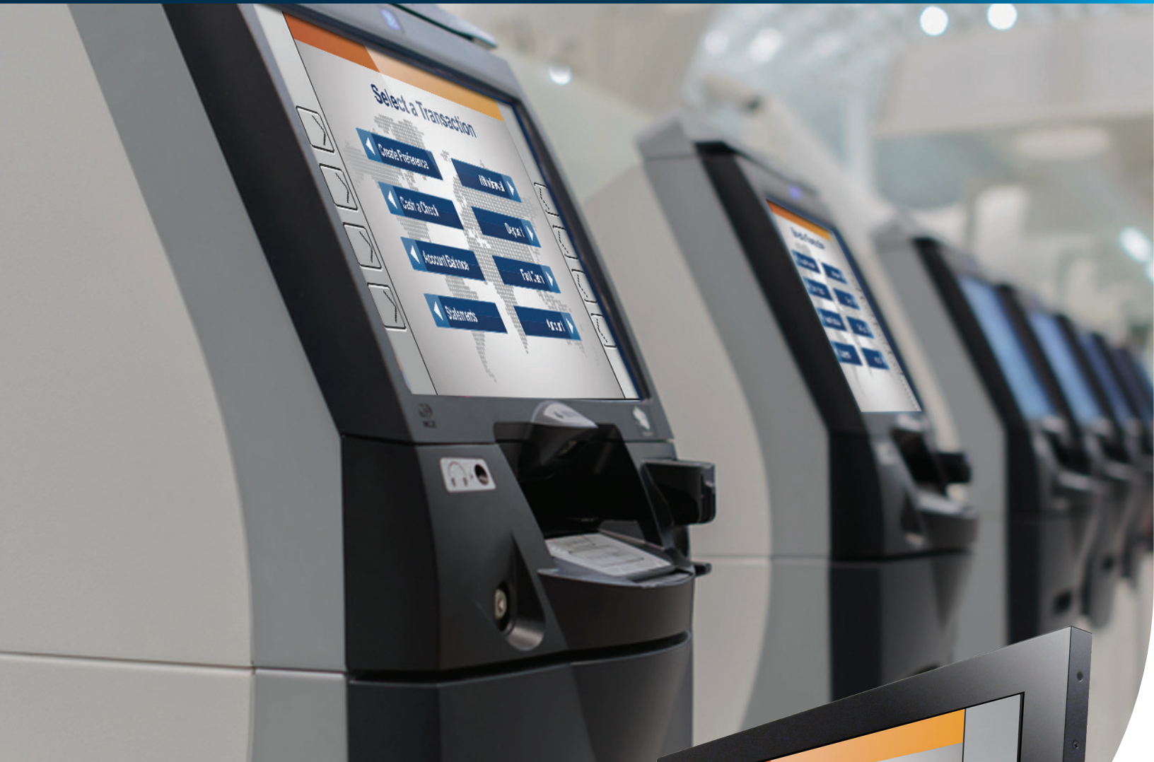
22 Inch, 1080p Open Frame PCAP Touch Monitor