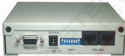
Figure 2: Regcom Rear Panel

The Hydra uses a bi-directional 2-wire RS-485 data bus to communicate to the slave devices. The device at each end of the network must be terminated. An 8-DIP switch on the rear of the unit is used to set the termination. Switch No. 8 is the terminal switch. When set to ON, the device is terminated. When set to OFF, it will be un-terminated.