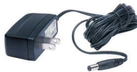
Power Supply Input: 100~240 VAC 50/60 Hz 1.2A Output: +24 VDC, 1.5A