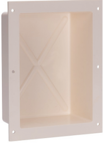
Plastic Back Box of AOP-SP and TLMC for flush mounting Dim: 8"H x 6.25"W x 2.75"D