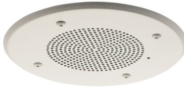
Ceiling Flush Speaker Grill Baffle for TLM-CF with 4" speaker Dim: 7.65" Dia.