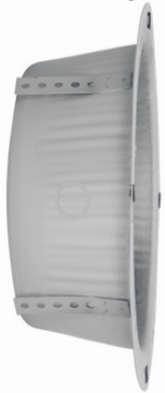
Ceiling mount backbox for TLI-CF Dim: 12.25" Dia. x 4"D