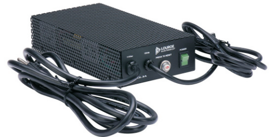
DG-12II and DG-25III Power Supply Input: 100~240 VAC 50/60 Hz 4.5A Output: +15 VDC, 12.3A