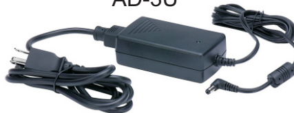
Universal Power Supply 100~240 VAC 50/60 Hz 0.8A +24 VDC, 1A