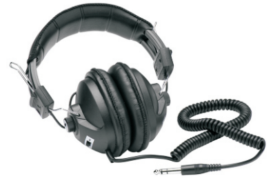
Stereo Headphone 8Ω, 100mW, with 1/4" plug Volume control on each ear