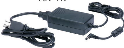
Universal Power Supply Input: 100~240 VAC 50/60 Hz 0.3A Output: +12 VDC, 500mA