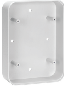
Plastic Back Box for TLM-W Dim: 6.9"H x 5"W x 1.65"D