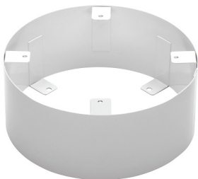
Mounting Ring for TLM-CS Dim: 7.38" Dia. x 3"D