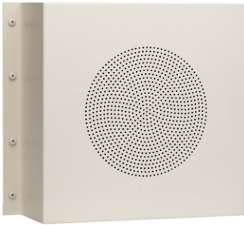
Square Surface Mount Vandal Resistant Baffle Dim: 11"H x 13"W x 4"D