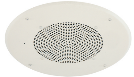
Ceiling Flush Speaker Grill Baffle for TLI-CF with 8" speaker Dim: 12.87" Dia.