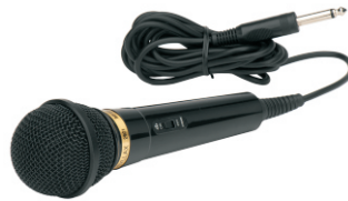
Low Impedance Handheld Microphone 600Ω