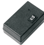
Portable Sound Generator for use with DG-25III Dim: 2 1/8" W x 3 1/2" H x 1 3/4" D Weight: 4 oz