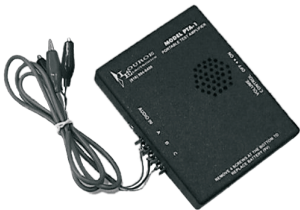
Portable Test Amplifier for use with DG-25III Dim: 3 1/8" W x 4 1/4" H x 1 1/2" D Weight: 5 oz