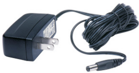
Power Supply Input: 100~240 VAC 50/60 Hz 0.3A Output: +12 VDC, 500mA