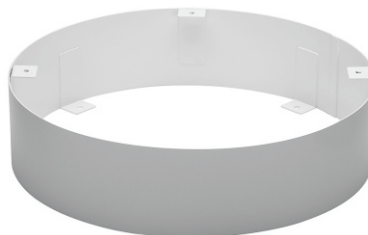
Mounting Ring for TLI-CS Dim: 12.38" Dia. x 3"D