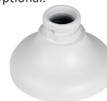
PFA106 Mount Adapter