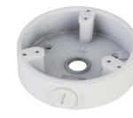
PFA137 Junction Box