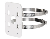
PFA152-E Pole Mount