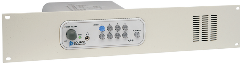
AP-8-RM Audio Base Station

The AP-8-RM is a rack mounted four- zone audio base station designed to interface with a DVR, VCR or other recording devices that accept line level input. The AP-8-RM Audio Base Station contains a built-in 3" speaker and volume control for producing live audio and audio playback. Has mute switch to mute audio from being heard at the speaker.