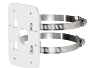
PFA152-E Pole Mount