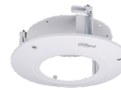
PFB200C In-ceiling Mount