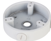
PFA137 Junction Box