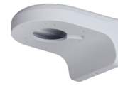
PFB203W Wall Mount