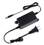
DH-PFM320D-US Power Adapter